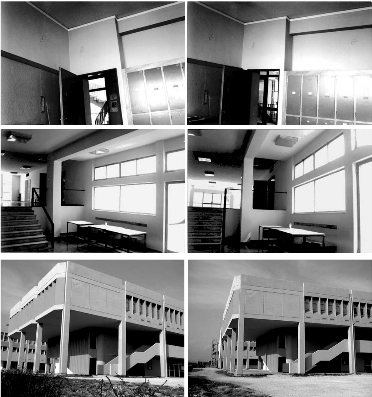
Figure 3. Stereopairs P_1 (top), P_2 (middle) and P_3 (bottom) used in the examples.